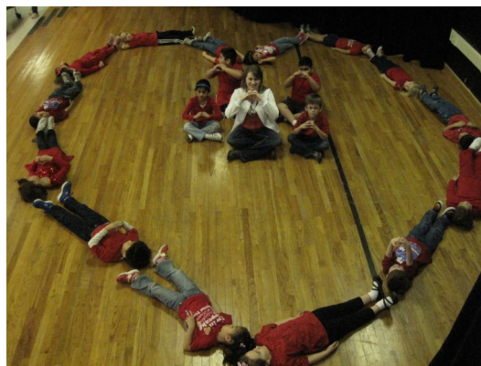
Go Red Challenge