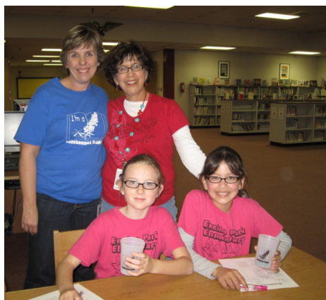
Bluebonnet Book Party

“There is more treasure in books than all the loot in Treasure Island.” - Walt Disney